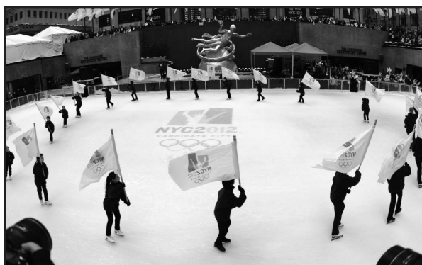
Children's Performance Club at the NYC2012 pep rally.