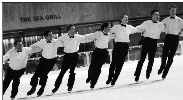
Our Company members as the Hot Chocolate waiters in Polar Express.