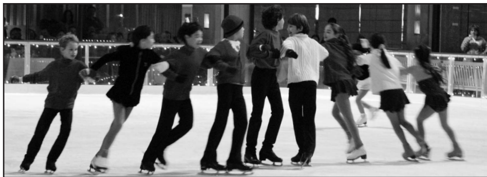
Ice Theatre Children's Performance Club.

Broadening our seminar division, Ice Theatre created a department called Master Class . Seven well-known choreographers have each created a master class to be taught in seminars around the country. The first Master