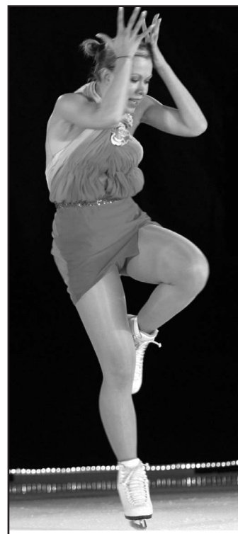
Olympic Champion Oksana Baiul performing with ITNY.