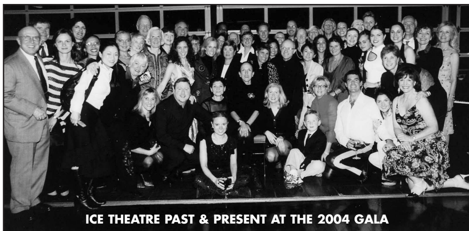
ICE THEATRE PAST & PRESENT AT THE 2004 GALA