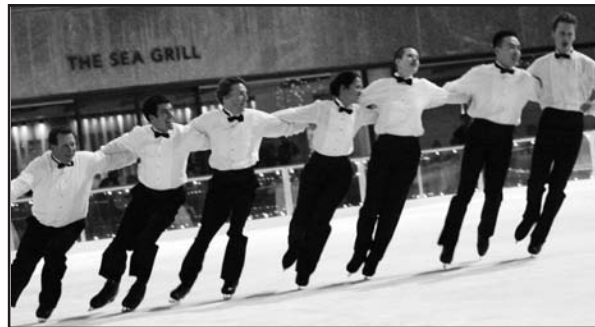
Our Company members as the Hot Chocolate waiters in Polar Express.