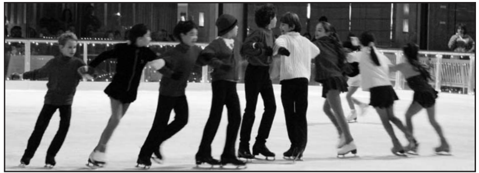
Ice Theatre Children's Performance Club.

Broadening our seminar division, Ice Theatre created a department called Master Class . Seven well-known choreographers have each created a master class to be taught in seminars around the country. The first Master