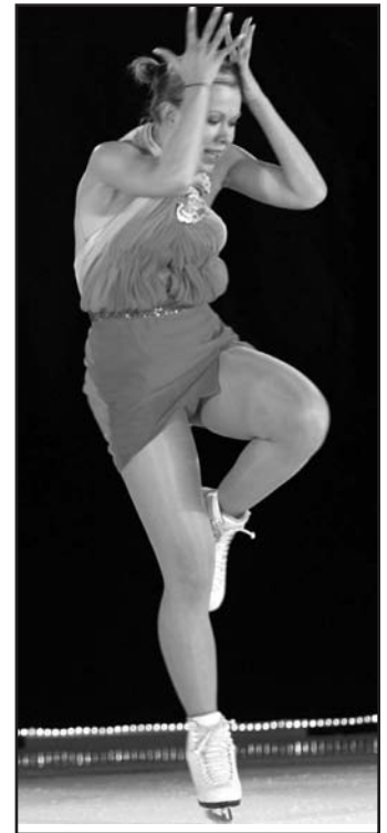
Olympic Champion Oksana Baiul performing with ITNY.