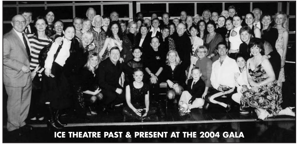
ICE THEATRE PAST & PRESENT AT THE 2004 GALA