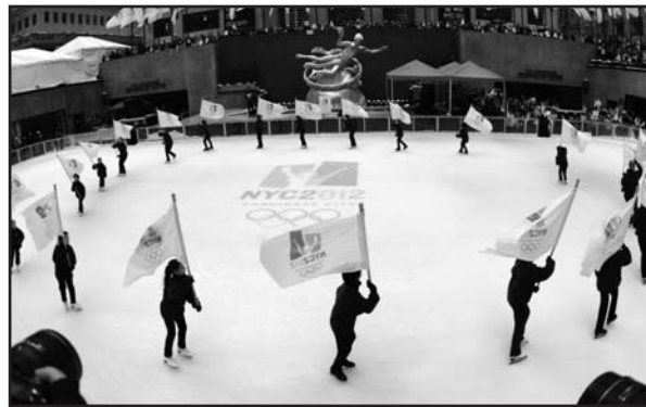
Children's Performance Club at the NYC2012 pep rally.